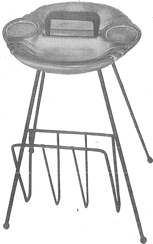
36M—With magazine rack, as shown . . . . . 34M—Same with square tray . . . . .