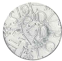
94 TRC—CATTLE BRAND