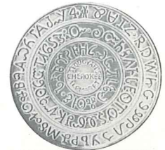
7 TR—CHEROKEE ALPHABET

82—6 cup COFFEE CARAFE WITH WARMER, LID & 2 CANDLES—5.00 CARAFE & LID ONLY—3.50