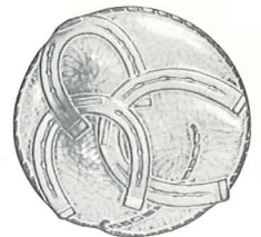
94 TRH—HORSE SHOE