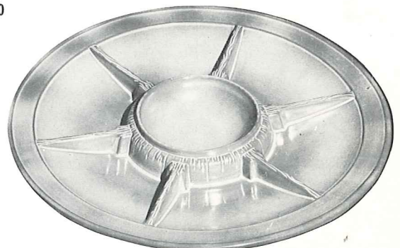
94FC 7 SECTION, ONE-PIECE SUSAN ON BALL BEARING BASE—15"—7.50 SUSAN ONLY—6.50

ACCESSORIES WHICH CAN BE USED WITH ALL DINNERWARE PATTERNS "FOR THE SHEER PLEASURE OF CASUAL LIVING"