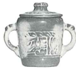
7B-6 oz. SUGAR-1.00