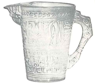
7D-60 oz. PITCHER-2.50