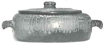
7V-2 qt. BAKER-2.75