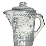
7J-2 cup TEA POT-1.20