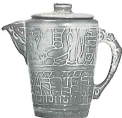
7T-6 cup TEA POT-2.50