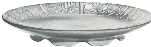
7FC-15" CHOP PLATE-7.00