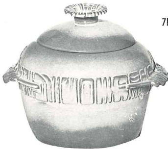
7WL-5 qt. BAKER-5.00