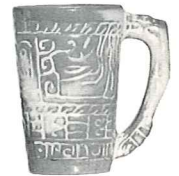
7M-16 oz. MUG-1.10