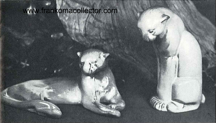
These are designed as a pair for they compliment each other. Seated Puma by Joseph R. Taylor — #114 — 7" Tall — 3.50 Reclining Puma by Joseph R. Taylor — #116 — 9" Long — 6.50