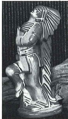
INDIAN CHIEF: A proud dancing warrior; by Ray Murray — #142 — 8" Tall — 3.50