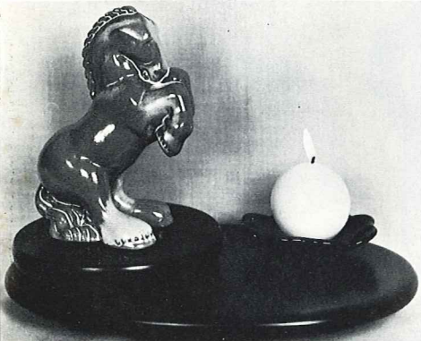
RARING CLYDESDALE by Joseph R. Taylor — #107 — 7" Tall — 5.00