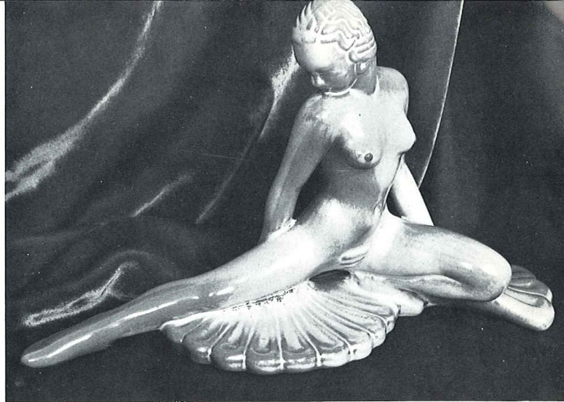
One of the few pieces sculptured after the famous Fan Dancers. It traveled the National Museum Circuit as part of the annual Ceramic Sculpture Show. The Fan Dancer by Joseph R. Taylor — #113 — 8½" x 13½" — 12.50.