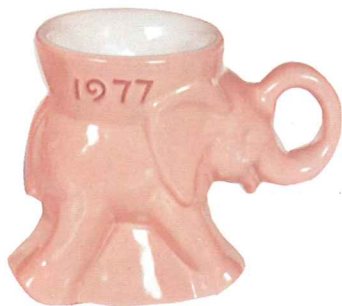
1977 ELEPHANT MUG

The original "Elephant Mug" was created for the National Republican Womens Club and copyrighted by Frankoma in 1969 and patented in 1970. The "Donkey Mug" was created in 1975 copyrighted and patented.