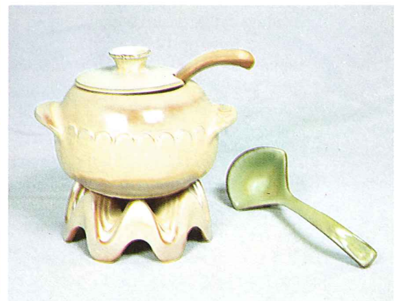
246—3 QT. SOUP TUREEN 12.00 246/W—TUREEN W/WARMER 18.50 246/P—TUREEN W/PLATE 16.50 247—SOUP LADLE—(NEW) 5.00