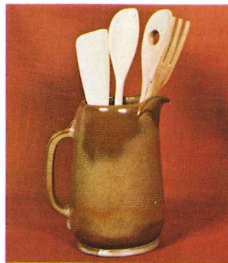
81—WITHOUT SPOONS 6.00