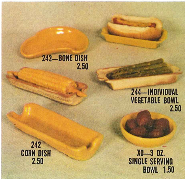
243—BONE DISH 2.50