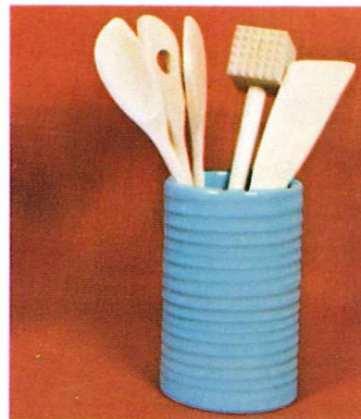
172—WITHOUT SPOONS 4.25