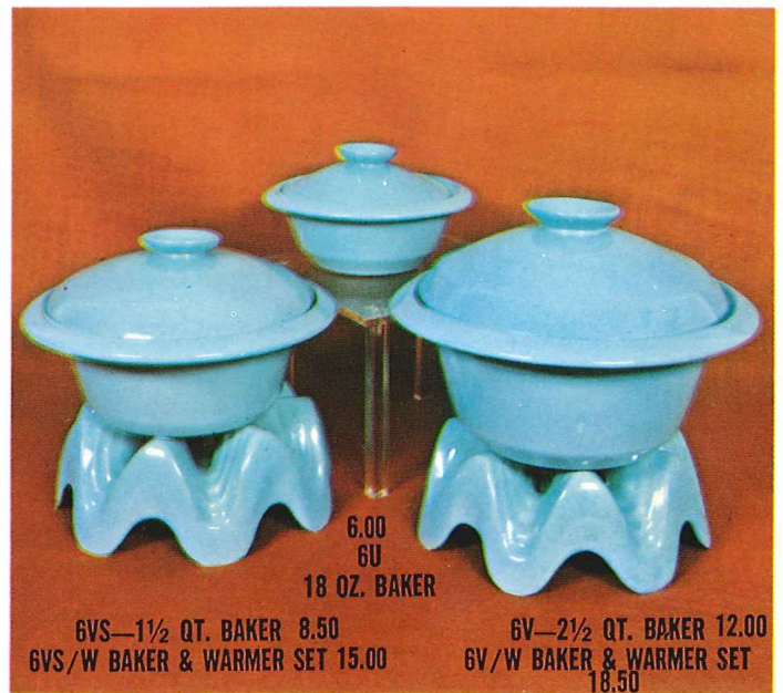
6.00 6U 18 OZ. BAKER 6VS—1½ QT. BAKER 8.50 6V—2½ QT. BAKER 12.00 6VS/W BAKER & WARMER SET 15.00 6V/W BAKER & WARMER SET 18.50