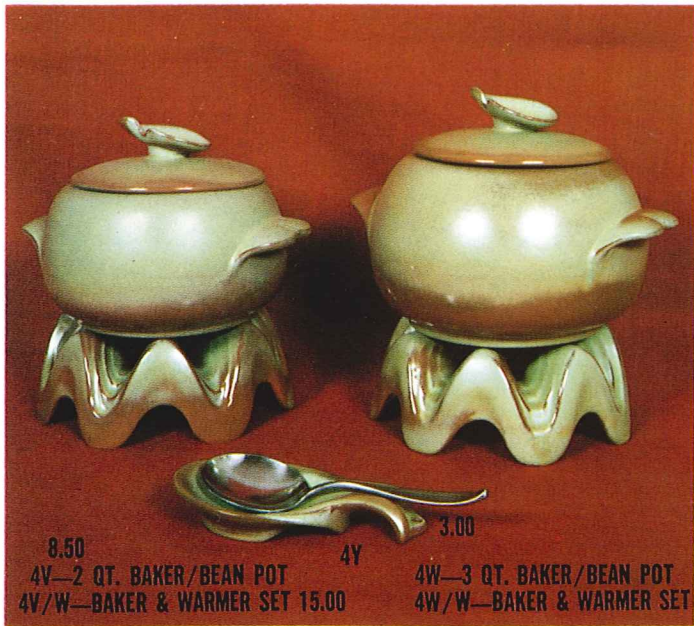
8.50 4Y 3.00 4V—2 QT. BAKER/BEAN POT 12.00 4V/W—BAKER & WARMER SET 15.00 4W—3 QT. BAKER/BEAN POT 18.50 4W/W—BAKER & WARMER SET