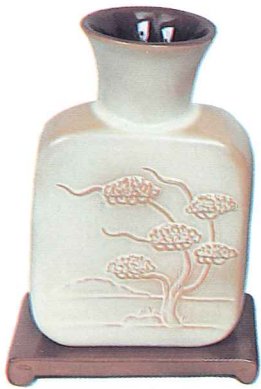
V-14—DESERT GOLD/COFFEE 20.00