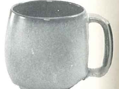
4M—4 1/2"—18 OZ. MUG 4.50