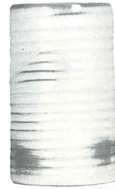
172—6 1/2" RINGED CYLINDER VASE 4.75