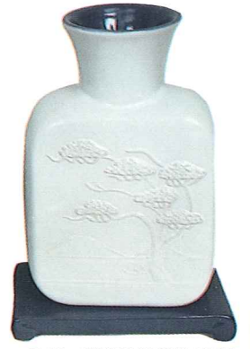
V-14—WHITE/NAVY BLUE 20.00