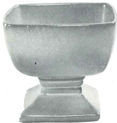
23A—6" SQ. PEDESTALLED VASE 6.50