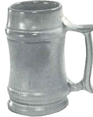
M2—6"—18 OZ. MUG 4.50