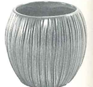
T7—3 1/2" COCONUT PLANTER 2.75