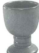
26LC—4 1/2"—6 OZ. TUMBLER VASE 3.25