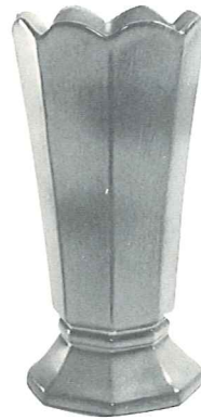
64—9 1/2" OCTAGONAL VASE 7.75