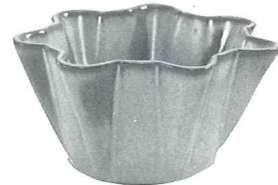
F33—3 3/4x7" FLUTED PLANTER 5.50