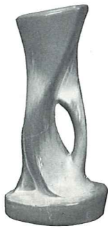
95—8 1/2" FREE FORM VASE 6.50