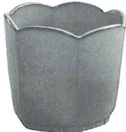
37—4" HEXAGONAL PLANTER 3.25