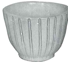
176—4" PLANTER 4.00