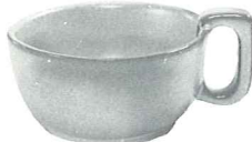
4SC—5" CUP-BOWL 3.75