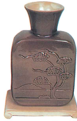
V-14—COFFEE/DESERT GOLD 20.00