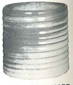
272—4" RINGED CYLINDER VASE 3.25