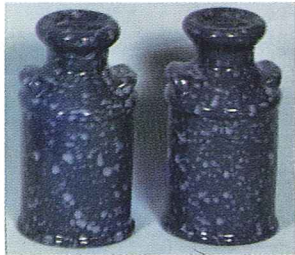
* Milk Can Salt & Pepper MC - 4 1/2" 8.00 pr.