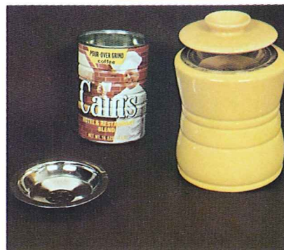
6V—2 1/2 QT. BAKER 14.50 6V/W BAKER & WARMER SET 22.00