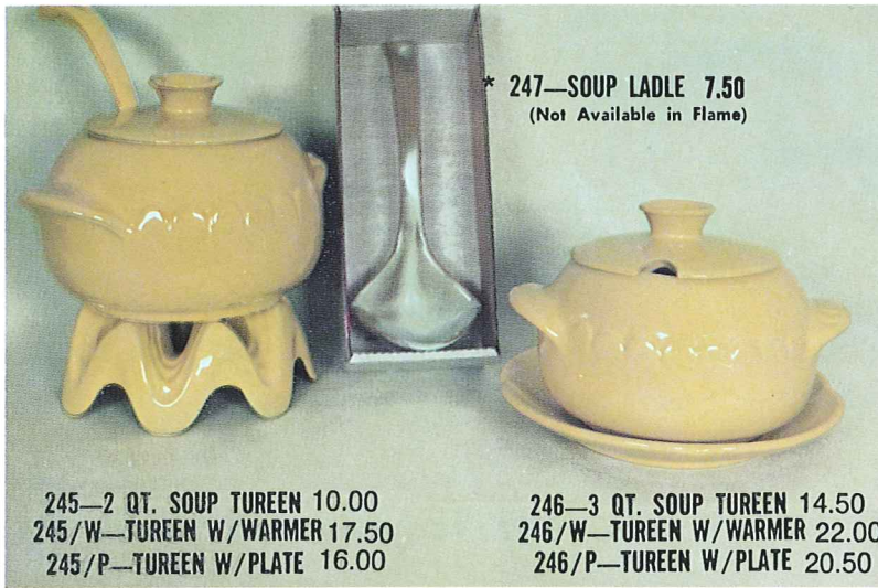
* 247—SOUP LADLE 7.50 (Not Available in Flame)