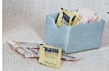
* TISP-Sugar Pack Holder - 3.50