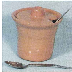
* 6 oz. Jelly Jar w/Lid 802 - 5.00