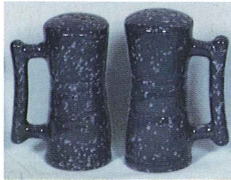
* 4 1/2" Salt & Pepper 26-H - 7.00 pr.