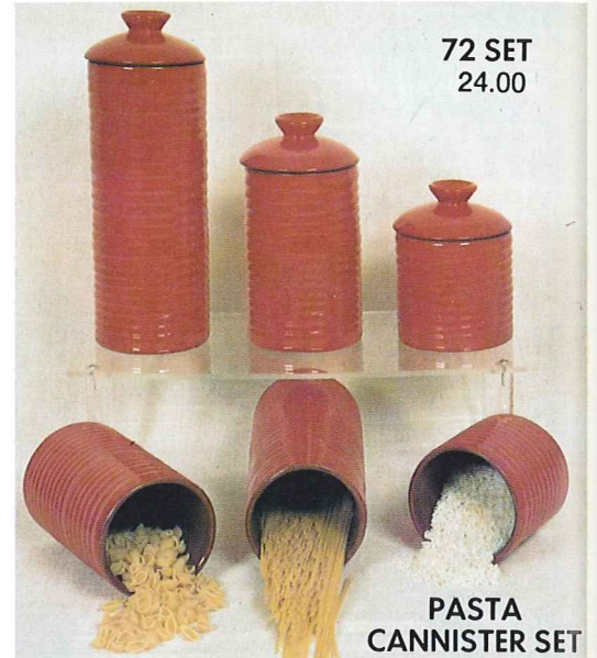
72 SET 24.00