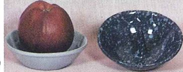
* RH - 4 1/2" Ring Holder/Apple Bake - 4.00