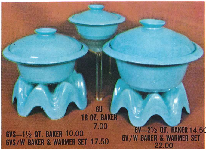
6U 18 OZ. BAKER 7.00