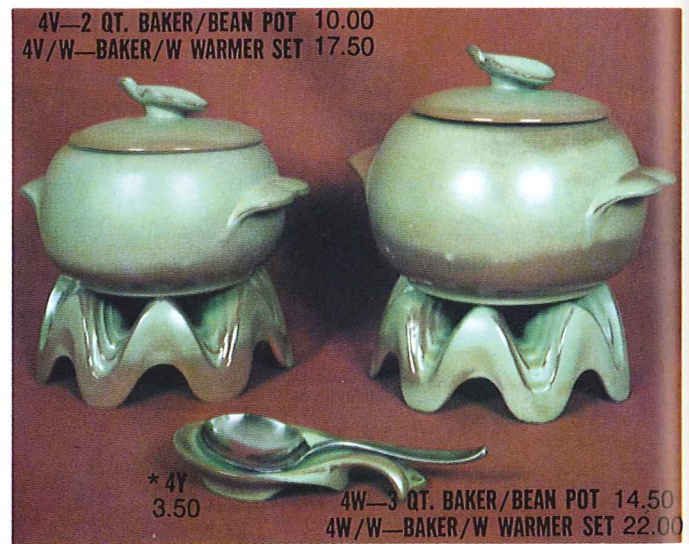
4V—2 QT. BAKER/BEAN POT 10.00 4V/W—BAKER/W WARMER SET 17.50